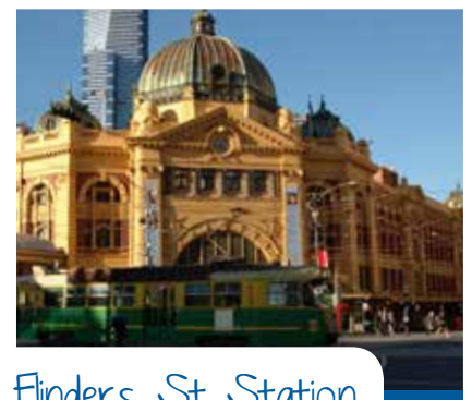
Flinders St Station