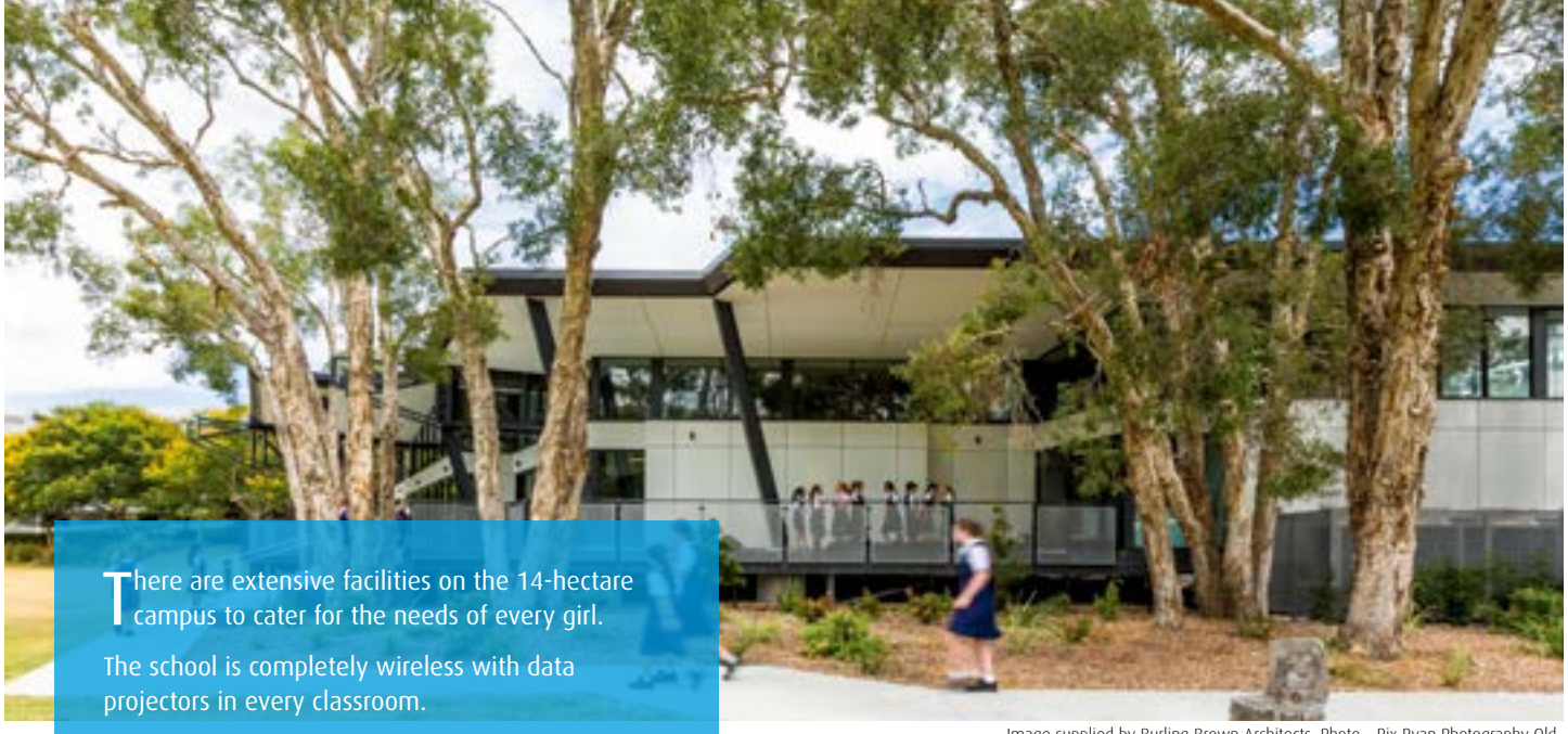
Image supplied by Burling Brown Architects. Photo – Rix Ryan Photography Qld