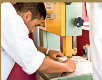
Hard Material Technology (Wood)