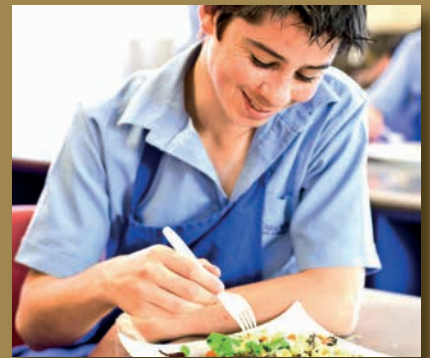
Food and Nutrition