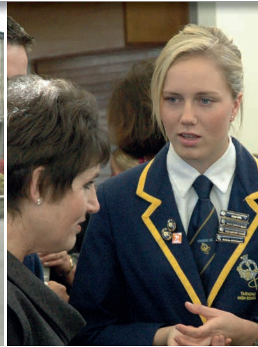
Prime Minister of New Zealand, the Right Honourable John Key, visiting Taradale High School accompanied by school leaders

“The degree to which we cultivate the talents of those who pass through this school will be the gauge by which we are judged”