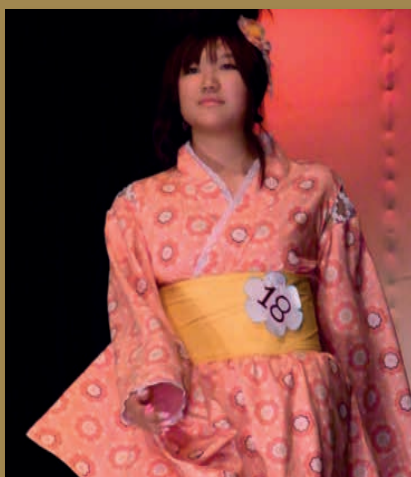
Wearable Arts (Textiles)