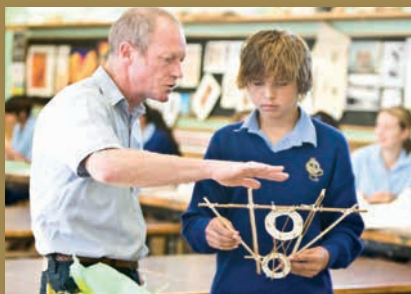
Junior Art class