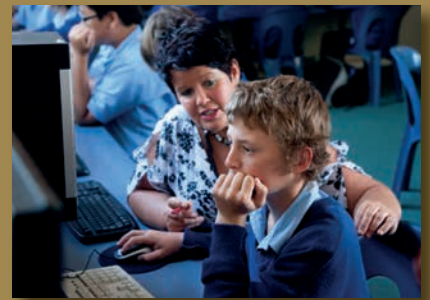
English with ITC